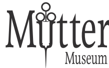
Medical history museum— syringe implies umlauts